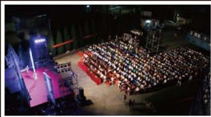
Mid Autumn Festival