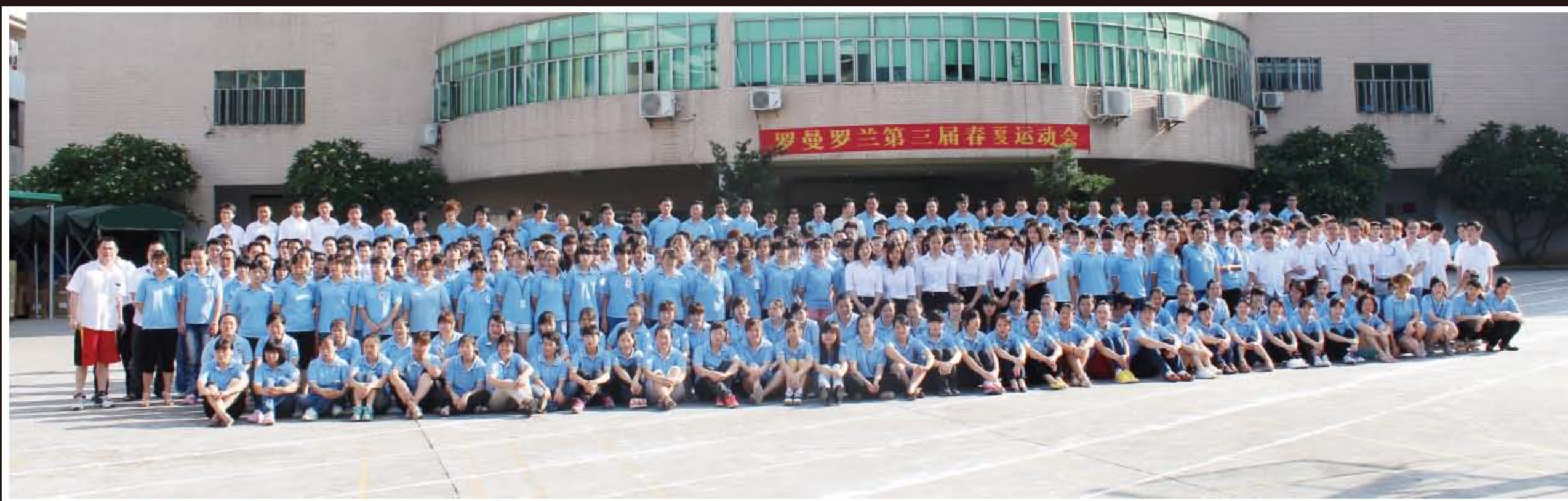
The Annual Sports Meeting