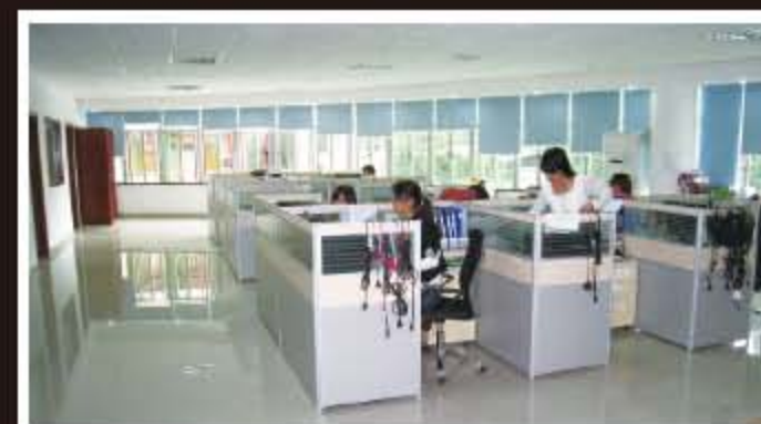
Part Of Office